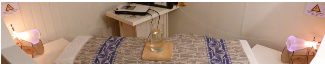
TheraPhi treatment of the sea salt and purified water solution for Remote Sessions

The sea salt crystals have to be fully dissolved in the water before the solution is also given the same treatment with 3 sessions each 6 minutes. Between each TheraPhi treatment of this solution, we place the water into a "charging environment" for 20-60 minutes.